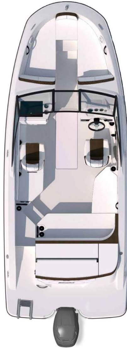
STANDARD PORT BUCKET SEAT