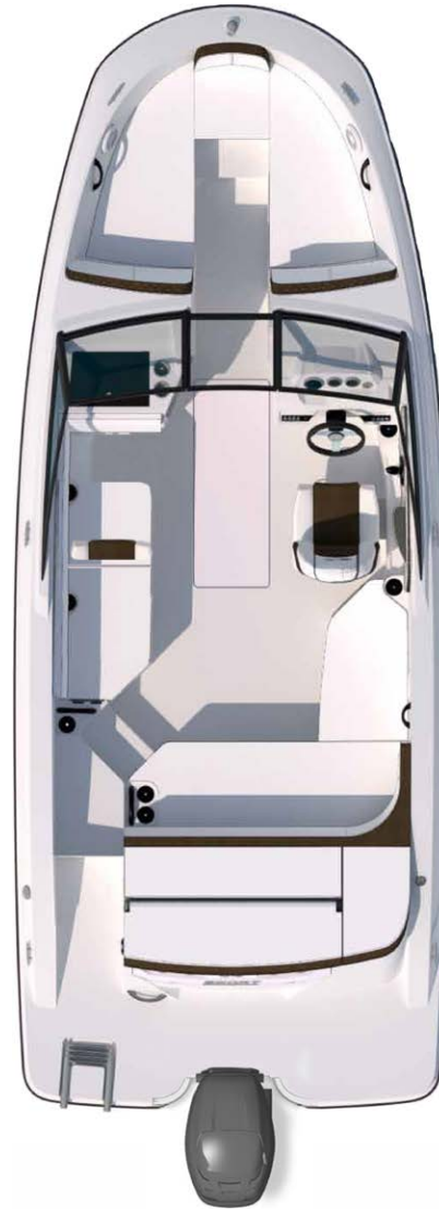
OPTIONAL PORT LOUNGER with convertible backrest