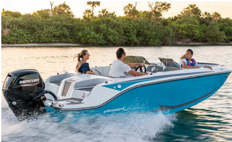
Element M17 Deck Boat