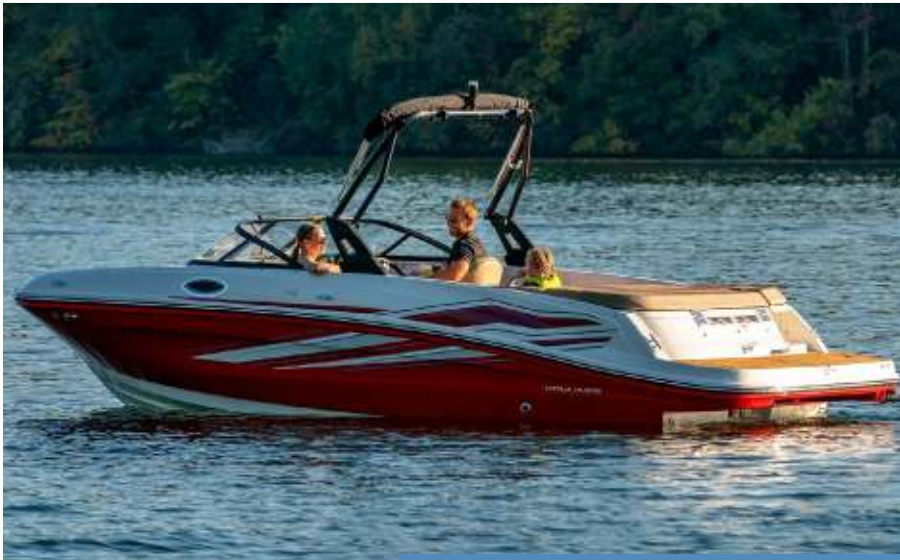
VR6 Bowrider – I/O & OB