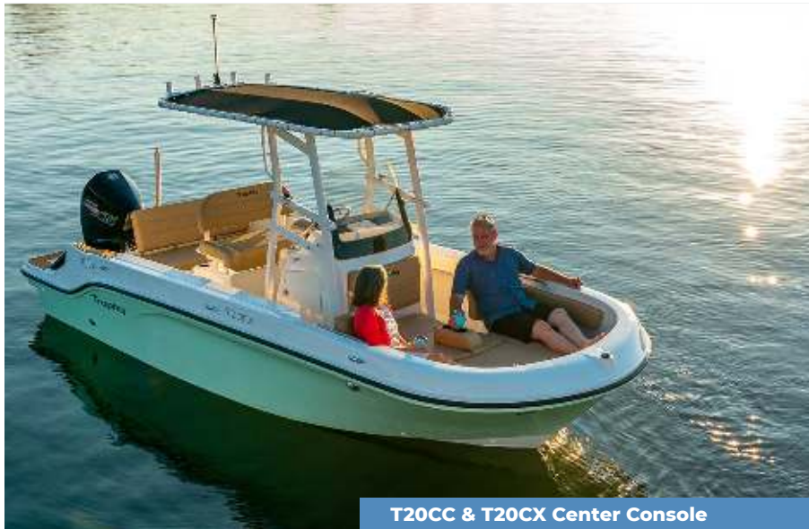
T20CC & T20CX Center Console