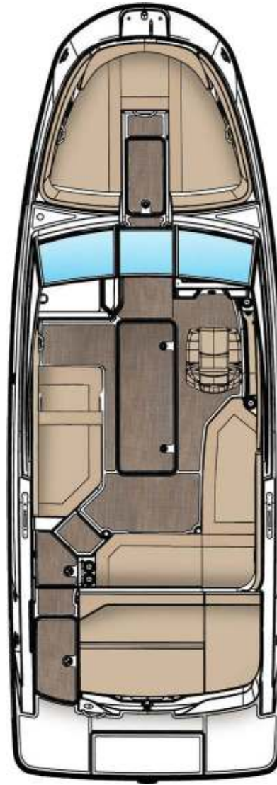
OPTIONAL PORT BENCH SEAT with reversible backrest