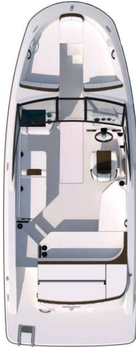
OPTIONAL PORT LOUNGER with convertible backrest