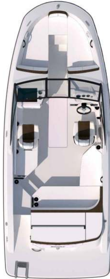
STANDARD PORT BUCKET SEAT