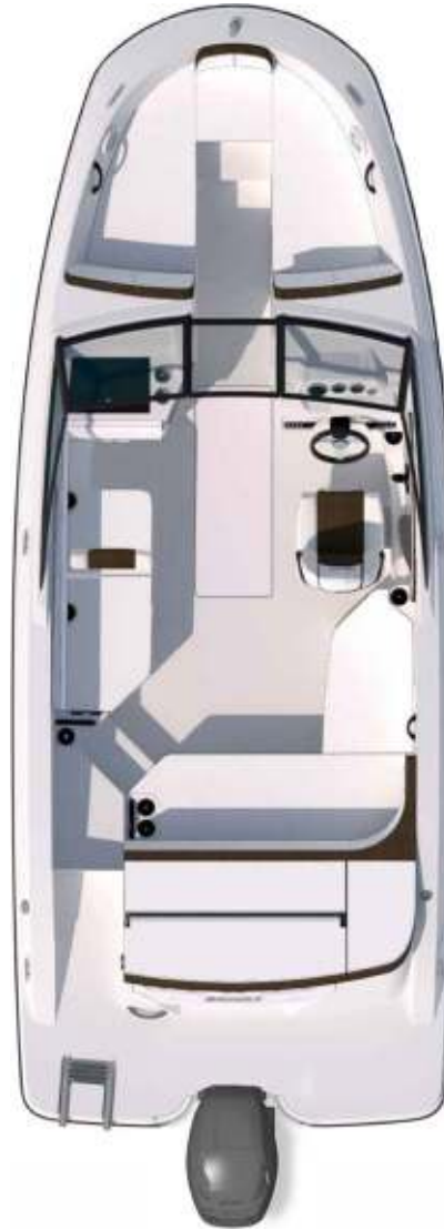
OPTIONAL PORT LOUNGER with convertible backrest