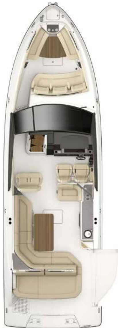
BOW & COCKPIT