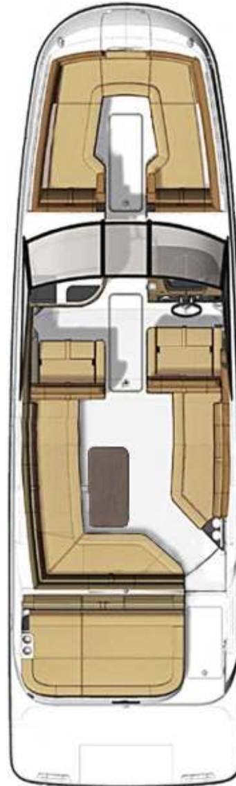
STANDARD SEATING PLAN